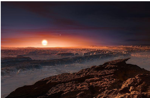
Figure 6: an artistic conception of the surface of Proxima Centauri B

Due to the astronomical distance between Earth and Proxima Centauri B, it is difficult to get accurate measurements of the super-earth but approximate measurements can be achieved.[1] The apparent inclination of the planet's orbit has not been measured. An estimated guess of the exoplanet's mass is between 1.17 and 2.77 earth's mass. The planet's orbit has been calculated to 0.05 AU, for comparison Mercury's orbit is 0.40 AU from the sun. The exoplanet might be tidally locked, which means that one side of the planet always faces the star.[7] Proxima Centauri B (as shown in figure 2) orbits its red dwarf once every 11.2 days at a semi-major axis. With a thick enveloping hydrogen and helium atmosphere; this likelihood has been calculated to be